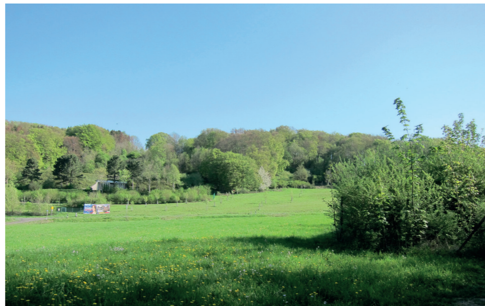
Landscape near Lengerich

The Lengerich Landscape park has to be designed to give people space for motion, activity and also for recreation. Educational content to the landscape space can and should complete the concept.