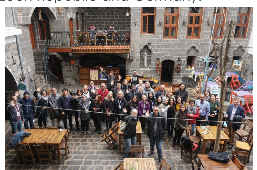
DU, International Relations Office